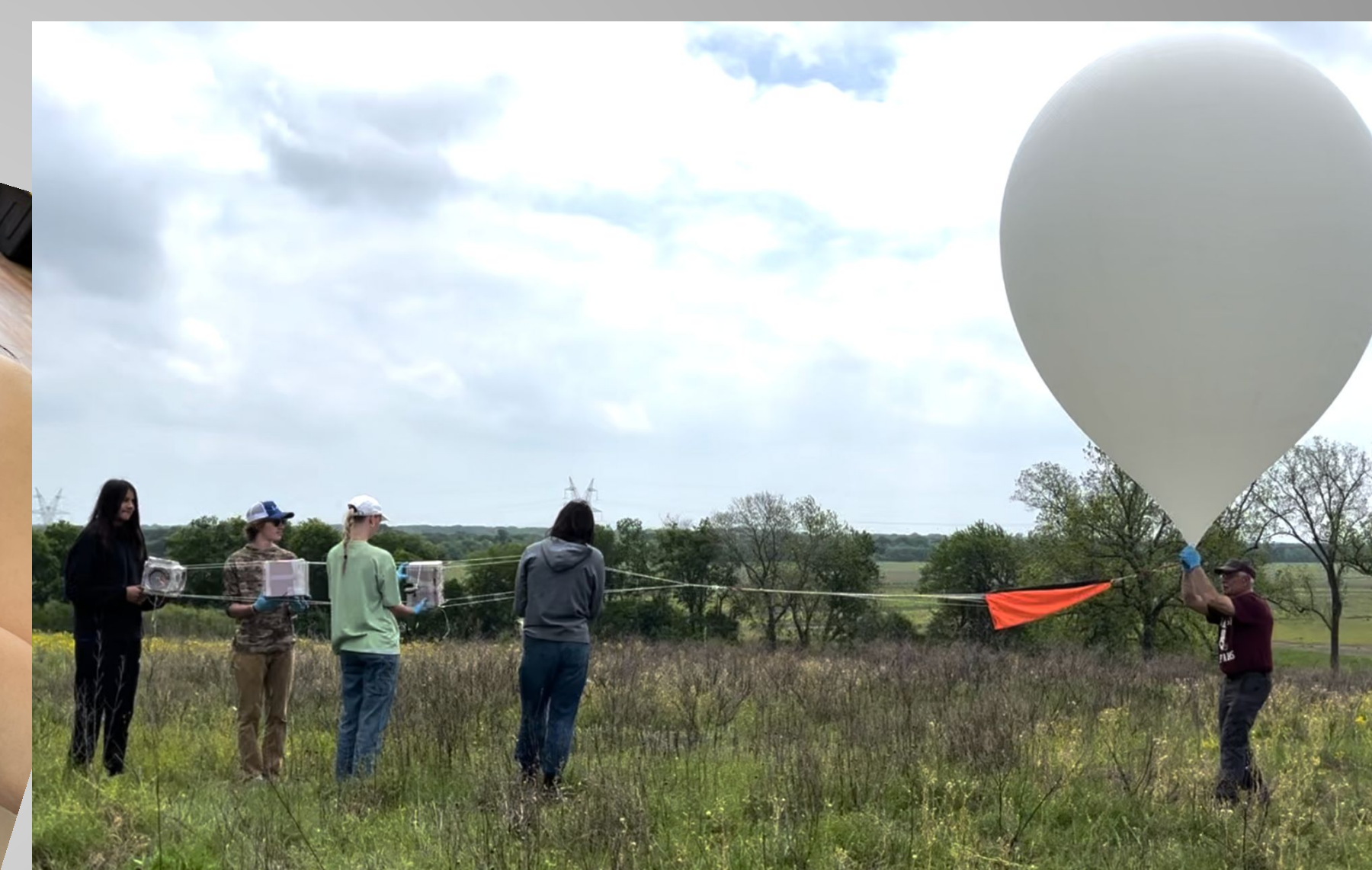
Figure 4. From left to right: map of balloon flight path, Tanice assembles the sampling payload box, Vincent helps with launching the balloon.