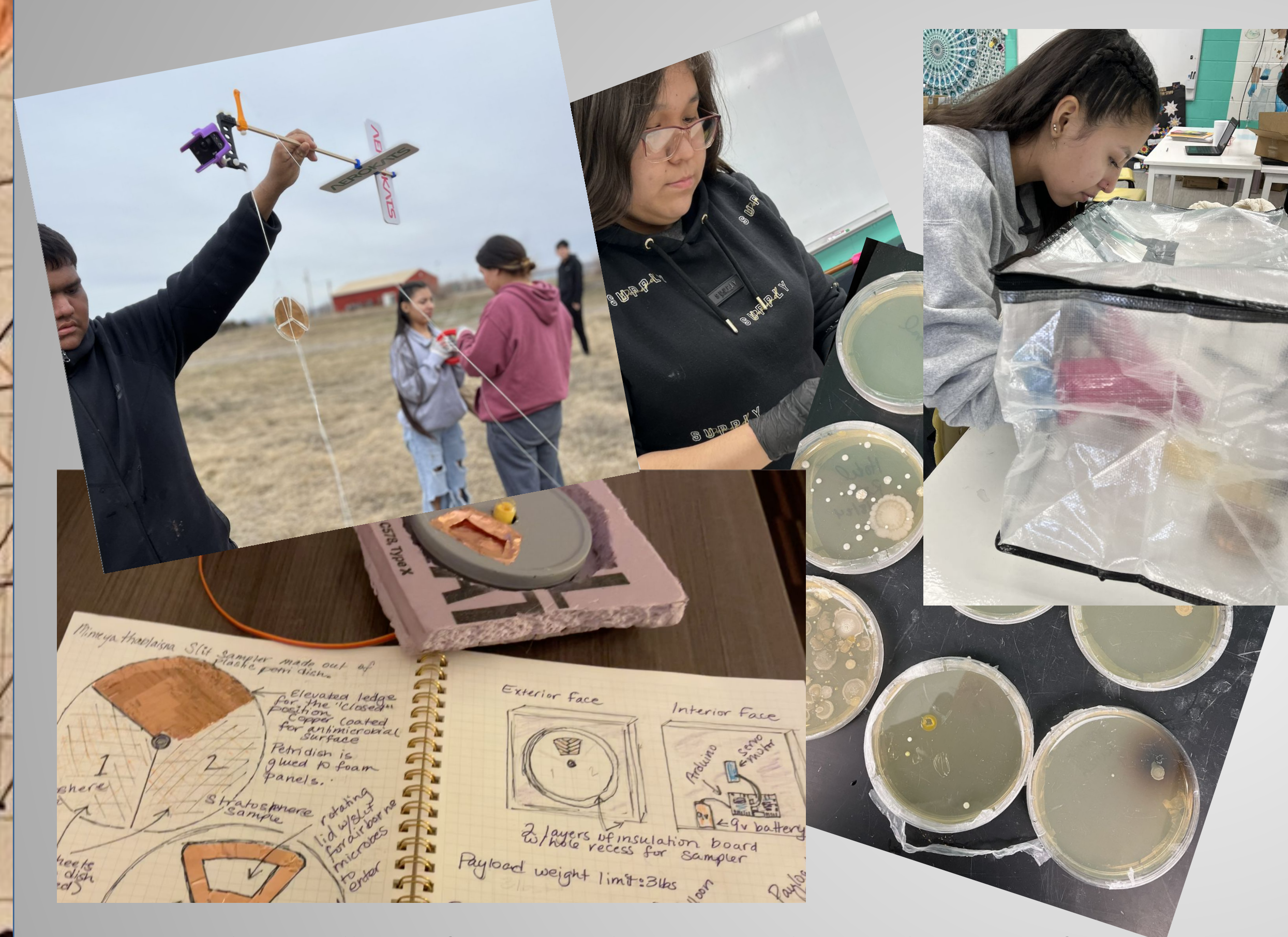
Figure 3: Photo collage of images taken during the development of the students' payload as well as a photo of bacteria samples cultured after the launch.