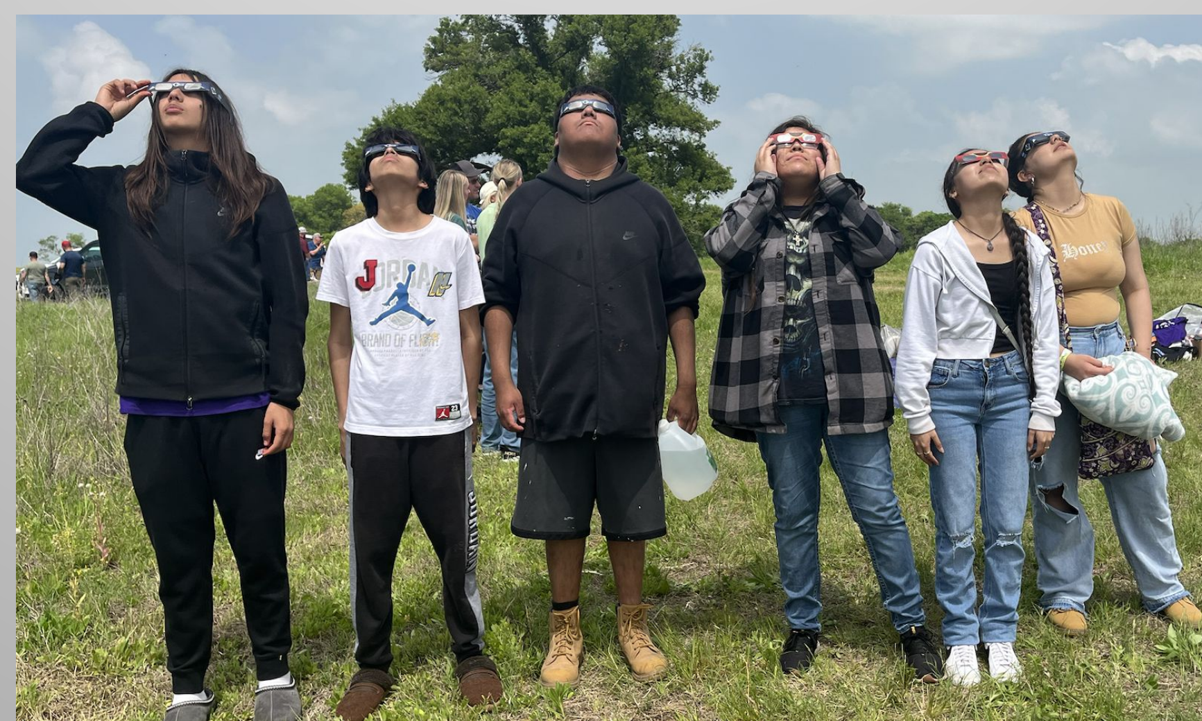
Figure 2. Eclipse Team watching the solar eclipse in Texas.

The poster illustrates the iterative engineering process undertaken by students as they designed and refined the sampling device. Through various investigations, they developed protocols for assembling, running, and retrieving their payload. Reflections from participating students offer insights into their learning journey, highlighting the acquisition of valuable skills and knowledge in STEM fields.