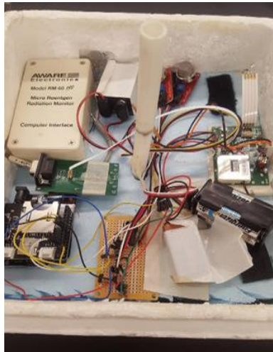
Fig. 1 The payload box with Arduino system with methane sensors (MQ-2 and MQ-6) and the AnaSonde system Geiger counter.

Methane data was collected across five flights from April 2014-May 2015. Changes in gas concentration and temperature create proportional changes in the resistance of the sensors, which were recorded as millivolts. Calibration of the methane sensors used 99.99% methane mixed with methane free air. The MQ-2 sensor was more sensitive to changes in concentration and temperature than the MQ-6. Calibration was first done with different concentrations of methane by mixing pure methane and compressed air at room temperature. The same concentration was subsequently measured at decreasing temperatures (ice bath). In addition, the sensors were tested in a pressure chamber and decreased to 5 mbar. No calibration tests were completed testing the effect of relative humidity, as relative humidity was not expected to have as large impact as temperature or concentration on the sensor measurement. [2] The sensor package included an Arduino Uno with MEGA 2560 processor and 5V input voltage attached to a methane sensor with a digital transistor to switch on/off the sensor (Fig 2). The system was powered by one 9V battery. Detector response was measured via analog output. The circuit diagram and coding were based on tropospheric gas detectors outlined by Di Justo and Gertz (2013).[7] Analog data and elapsed time were collected onto an SD card. The elapsed time was then correlated to altitude from GPS in the AnaSonde system.