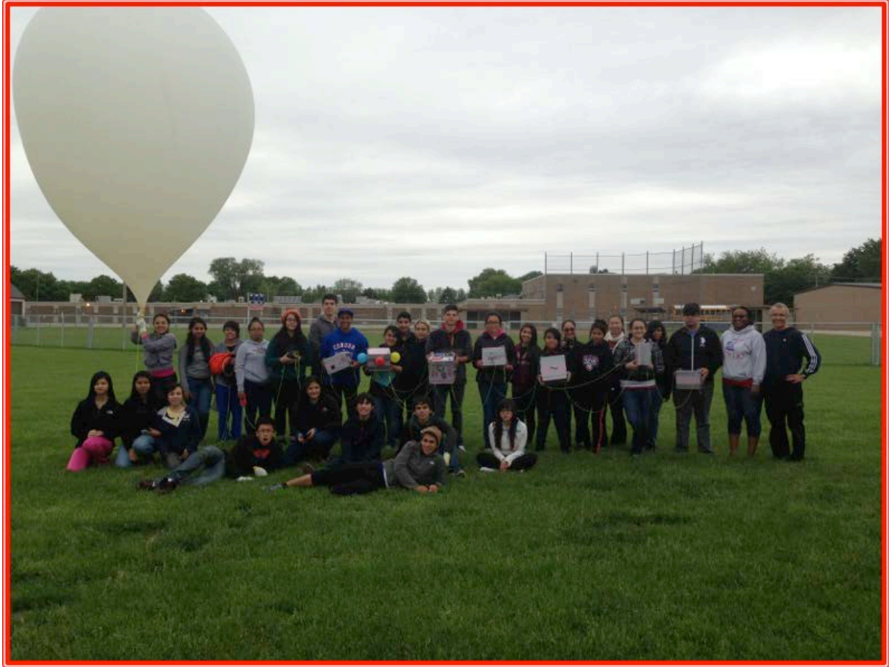
Fig 3: The Curie team just before launch