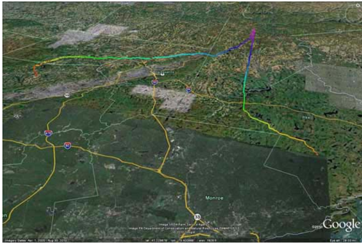
Figure 4. Balloon flight path

Figure 4 shows the flight path for the high altitude balloon flight. Burst occurred at 84,793 feet as reported by the onboard GPS. Average rate of ascent was 440 feet per minute while the average rate of descent was 1,500 feet per minute. However, during the initial descent, the rate of descent was much higher at 4,400 feet per minute.