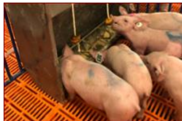
Figure 2. Nursery pig interacting with the environmental enrichment.