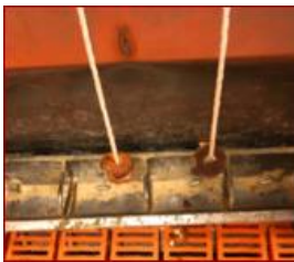
Figure 1. Enrichment device placement.

Six ingredients were used to make the biscuit: dried whey powder, corn starch, soybean oil, flour, sugar, and water. Ingredients were combined into a dough and stamped into 4 cm diameter cutouts with a 1 cm hole in the middle. Biscuits were baked at 190° C until golden brown. All biscuits were utilized in the nursery pens within 24 hours after baking. Two biscuits were threaded onto a 3 stranded, 0.5 cm diameter plain cotton rope, and the 2 biscuits were positioned on top of a 1 cm diameter flat washer (Figure 1). Each enrichment device was tied to the pen bars and secured in place with duct tape, so that the rope hung over the feeder and the biscuit hung at pig eye-level (Figure 2).