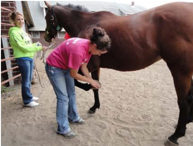
Figure 1. Student cleaning the hoof for the ANS 216 examination.