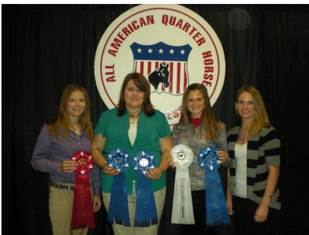
Figure 3. Iowa State University Horse Judging Team at the 2011 Quarter Horse Congress.