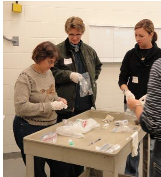
Figure 5. Master Equine Managers evaluating fecal parasites.