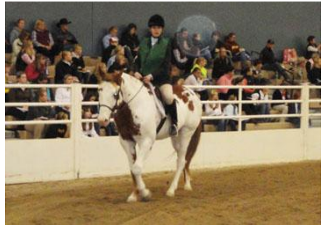
Figure 4. Iowa Horse Judges Certification Clinic and Iowa 4-H Horse Judging Contest