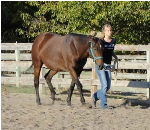
Figure 2. Preparing for the Little North American contest.