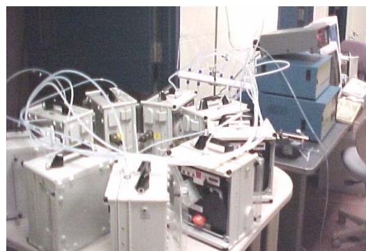
Figure 1. Lab setups for evaluation of SPM performance in measurement of \text{H}_2\text{S} and \text{NH}_3 .