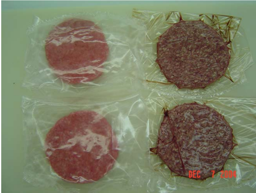
Packaged with MAP with 0.4% CO

The color of irradiated beef patties in vacuum and modified atmosphere packaging.