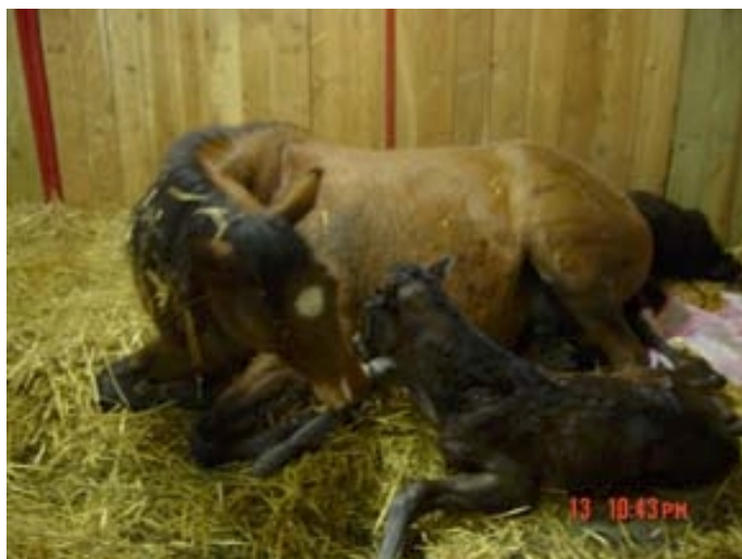
Figure 4. Hey Marthy (Thoroughbred mare) foaling on 3/14/03.

up to the barn ~35 days prior to her due date. For their assigned mare, the groups record general information on the mare - weight before foaling, weight after foaling, body condition score prior to foaling, nutritional status, health and hoof care and a brief reproductive history, record signs of approaching parturition in the mare, predict foaling using a predict-a-foal test, foal watch from 9:00 pm – 7:00 am, record foaling signs, and work with the foal after it is born (dip the umbilical cord, halter train, etc.)