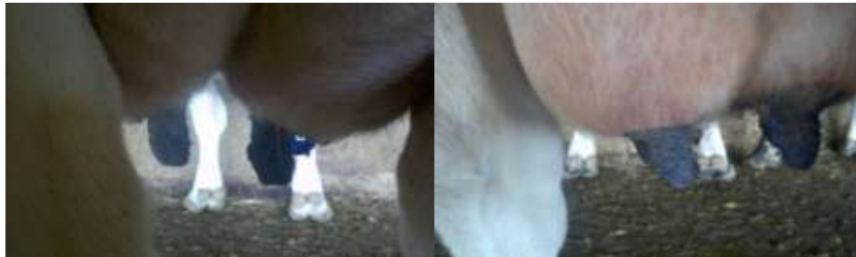
Cow NTB T-Hexx Left side