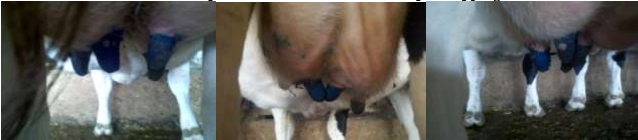
Cow 7894 T-Hexx right side