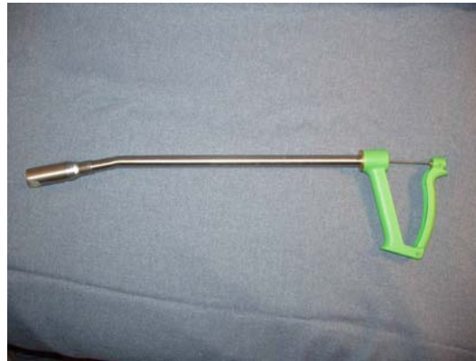
Figure 2. Balling gun.