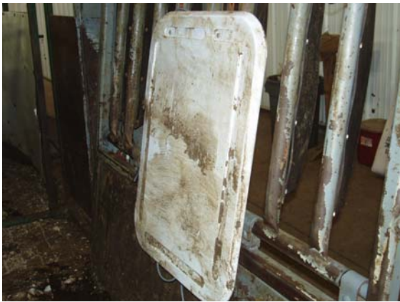
Figure 3. Panel antenna.