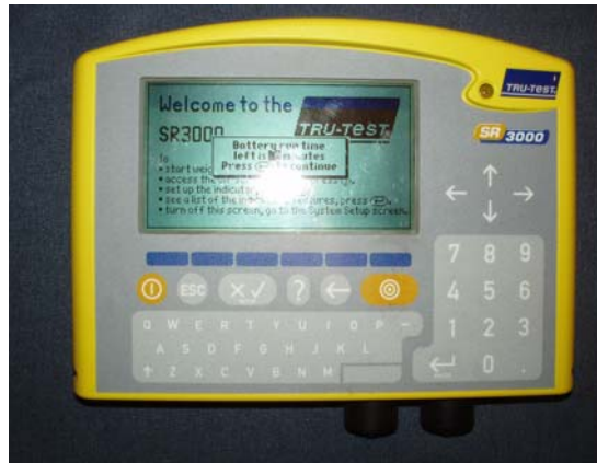
Figure 4. Weighing system indicator.