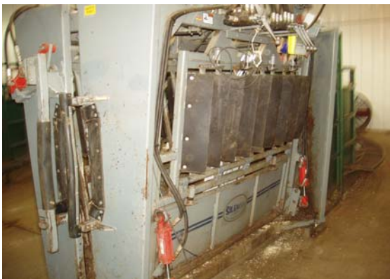
Figure 5. Hydrolytic restraining chute.