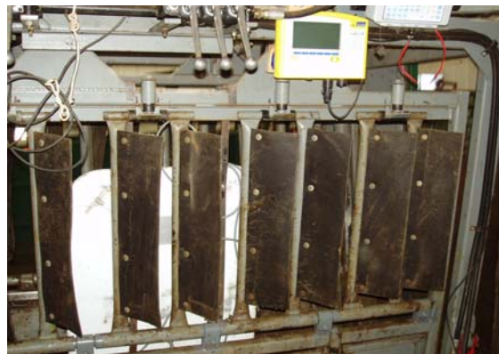
Figure 6. Reading system.