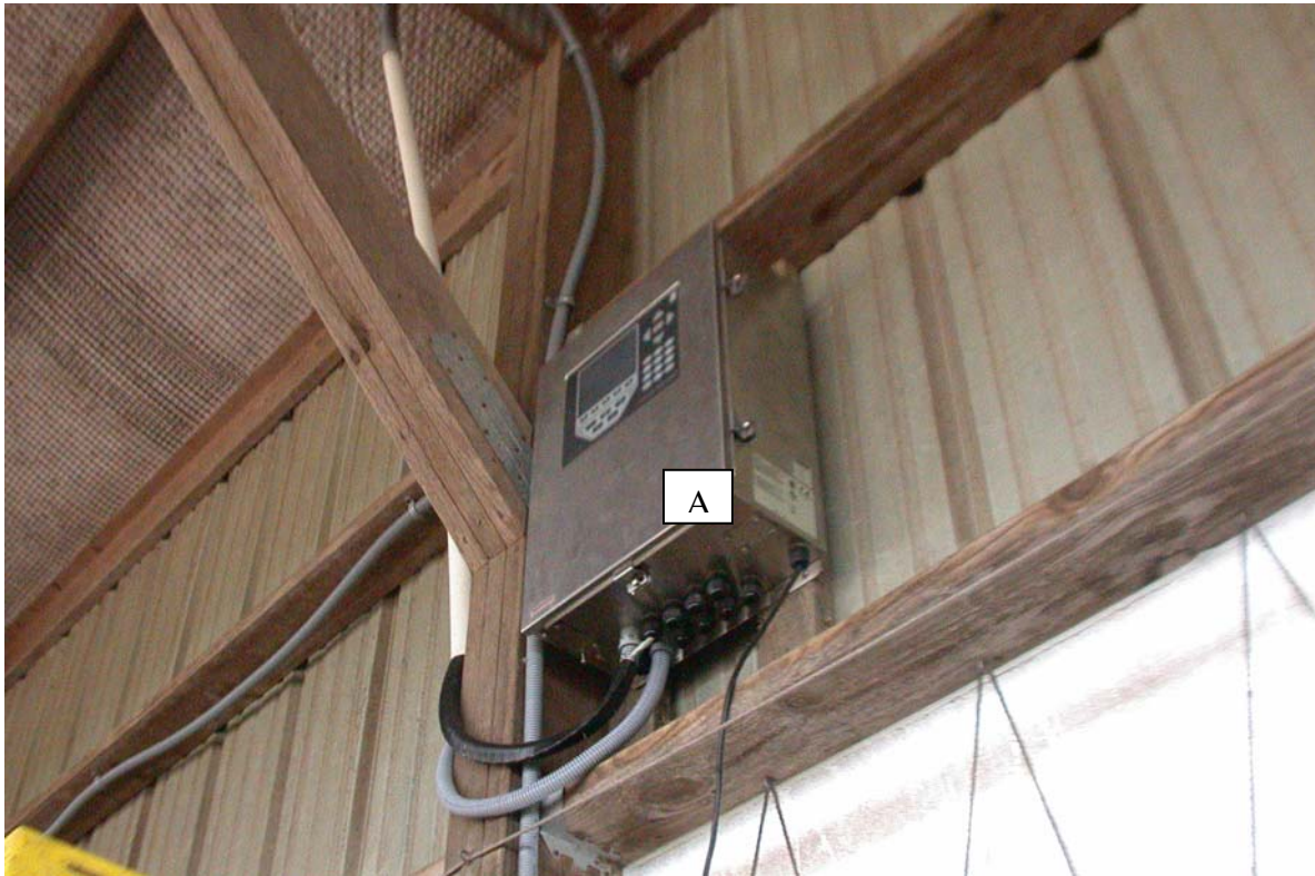
Key to labels: A=920i Rice Lake programmable indicator