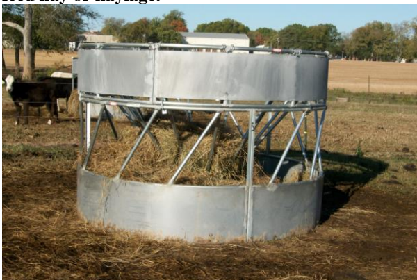
Figure 1. Each pen included one cone-style hay feeder to feed hay or haylage.

Nutrient analysis of the forage: Forage samples were randomly collected ( n = 10 bales / treatment). Samples were collected using a hay corer (40.6 cm long x 2.5 cm long) and mixed together for testing. Samples were stored in a plastic Ziploc freezer bag, frozen, and shipped to a commercial laboratory for a nutrient analysis (Table 1).