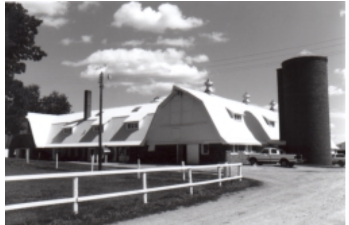
The main dairy barn and milking parlor at the Iowa State Dairy Farm is in largely original condition in both exterior and interior design. However, the milking parlor has been renovated periodically as new equipment was developed.

The present main dairy barn was built during the 1930s and completed in 1937. The building remains in largely original condition both inside and out although milking parlor modifications have been made as improved equipment was acquired over the years.