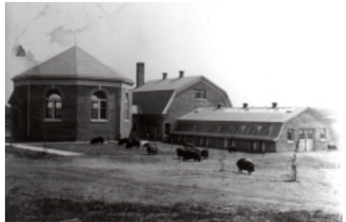
The hog barn and pavilion was built as a part of an effort to support Iowa State’s newly stated emphasis on swine production. It was state of the art with capability to study the effect of natural light and exposure on swine.

In 1922 a major swine facility was developed for producing animals and for teaching. The development of the barn and pavilion was part of a plan to develop a “New Purebred Hog Plant” at Iowa State College. The facility was located south of the site presently occupied by the National Soil Tilth Laboratory. The building, constructed of clay tile, consisted of two wings for swine housing and a pavilion for teaching swine management and visual appraisal of animals. The design included varied and extensive skylights and windows to evaluate the advantages of natural light and sun exposure in swine production. Cost of the new barn and pavilion designed by Proudfoot, Bird, and Rawson of Des Moines and built by Thomas Sloss (Iowa State College) was about $20,000.