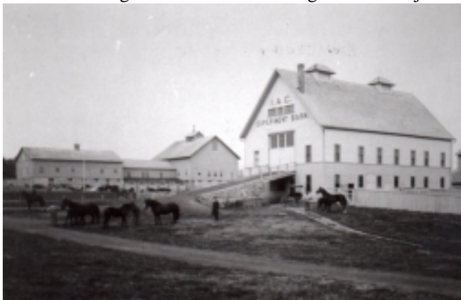
The first barn built for experimentation. It was designated Experiment Barn and the sign reads IAC (Iowa Agricultural College) Experiment Barn.

The Experiment Station Barn replaced an earlier building, designated the Iowa Agricultural College Experiment Barn, built in 1894 by Architects Nourse and Hallett and contractor Bisbee and Potter. This earlier building burned in 1902 along with an adjacent