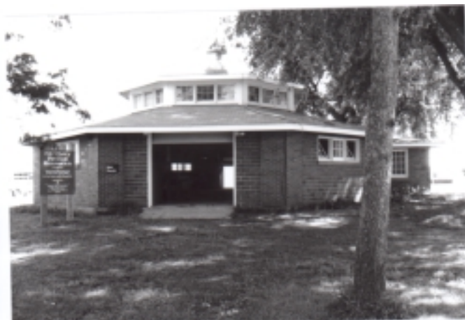
The Dairy Farm Pavilion is presently in use in teaching livestock selection and management. Students and faculty with support of the dairy industry recently restored the unit.

This oval facility is constructed of clay tile and provides seating for students and spectators at events. The unit has high windows for natural light and a delightful architectural character reminiscent of pavilions built at major fair grounds. The building was restored recently by an effort of students and faculty supported by the dairy industry. Construction was most likely in 1921 or 1922; a 1923 photograph shows a new building but the construction site was healed at the time.