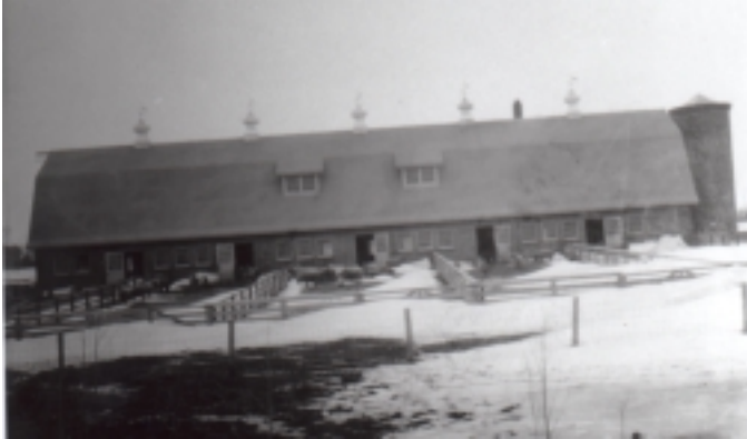
This barn was headquarters for the Iowa State sheep flock until 1965 when the unit was relocated to the present site on South State Avenue south of campus.

In 1922 a substantial sheep barn was built where the National Soil Tilth Laboratory now stands. This building was designed by Proudfoot, Bird, and Rawson of Des Moines and constructed under supervision of Thomas Sloss (Iowa State College). Walls were of clay tile. The roof style was gambrel with turned up eaves characteristic of the other barns in the area. The roof had shed dormers with windows and ventilators. The two wings formed an L-shaped design. The first wing was constructed in 1922 and the second was completed in 1925. The interior provided large group housing as well as small pens for breeding and lambing. The building was razed in 1969.