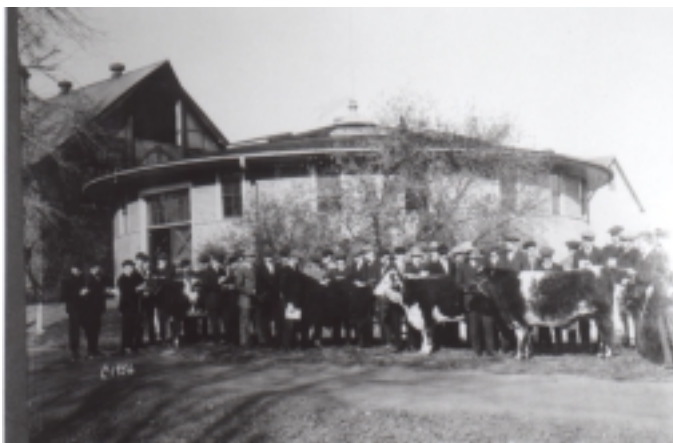
The first judging pavilion built on campus. It was later converted as a theater for the performing arts and was finally designated Shattuck Theater.