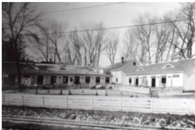
An early sheep barn of simple yet striking architectural design. The sheep barn built in 1922 replaced it. Construction date is not available; however, this photograph was taken in 1917. Railroad tracks in the foreground are for the Dinky, the rail line that ran from The Hub on campus to downtown Ames.

Photographs in the Iowa State University Archives that were made in 1917 show a sheep barn of wood-frame construction. The building was rich in architectural detail with eyebrow-shaped dormers built into the roof.