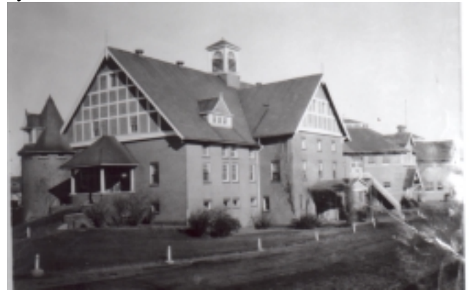
The new Experiment Station Barn was built to replace the original IAC Experiment Barn that was destroyed by fire. Two judging pavilions (Pavilions 2 and 3) appear immediately to the right of the barn.

cattle barn. The new barn, designated Experiment Station Barn was a substantial building constructed of brick, had a gabled roof, and a clay tile silo. The silo roof was of special interest in that it was of conical style reminiscent of tower roofs typically seen on French chateaux. The building consisted of two floors and a loft and was built at a cost of $17,858.59. Location was on Wallace Road near the present south wing of the Physical Plant building. Design work was by Liebbe, Nourse, and Rassmussen. H. W. Schleuter was the contractor. A lightning strike resulted in complete loss by fire in 1922.