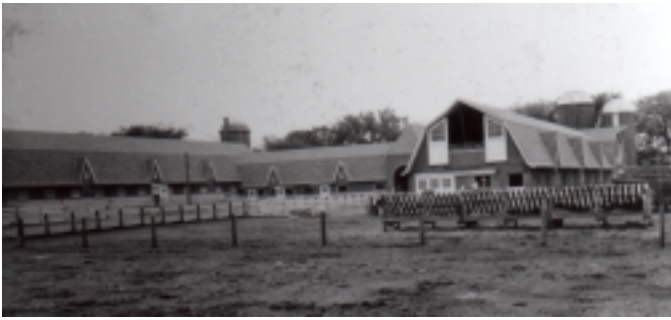
The Cattle Barn was generally known over the years as the Beef Barn. George Edwards, long-time herdsman, and students developed three International Grand Champion steers here.

The barn, eventually to be a U-shaped building, was constructed in phases. Design was by Proudfoot, Bird, and Rawson of Des Moines and construction was by Netcott Brothers. The barn represented the classical gambrel roof design with architecturally interesting gables built into the roof with windows for light and ventilation. In addition to the cooling effect of ventilation for the building, it was important for completion of the drying process for newly stored hay.