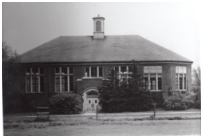
The judging pavilion was the site of many classes in livestock selection and management. The building was an important facility used in the training of Iowa State's judging teams that over the years won more national championships than any other university in the United States. This was the site of the Little International showmanship contest for many years. Numerous extension events were held here annually.

The building was completed in 1925. Proudfoot, Bird, and Rawson of Des Moines did the design; Thomas Sloss (Iowa State College) supervised construction. The building was oval and constructed of clay tile. The roof was enhanced by a large metal cupola. The walls were equivalent in height to two-story structures to accommodate tall windows around the entire building to maximize natural lighting. Remodeling was accomplished in 1931 to expand seating by building in fixed bleacher-type seating.