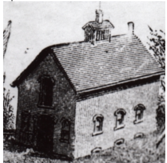
Iowa State's first horse barn built in 1870 was replaced in 1900 with a new horse barn that would later be remodeled and converted to the home of Landscape Architecture.

The need for the first building designated as a horse stable was endorsed by the Iowa State College trustees as early as 1868 and an appropriation of $2500 was made by the legislature the same year. Construction was not started until 1870, however. The barn was 30 x 40 feet with loft and basement and built of brick. No architect or contractor is noted in records. This barn was razed in 1900 and replaced with a brick structure that would serve as the horse barn until it was remodeled in 1930—1931 for use by the Landscape Architecture Department.