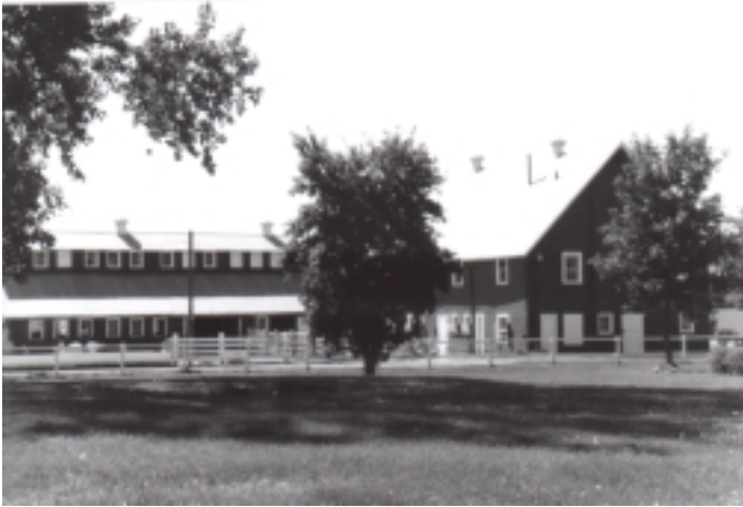
The original barn at the Iowa State Dairy Farm is still in use at the Mortensen Road site south of campus.

The development of this wood-frame building is mentioned in early records as being needed to relocate dairy cows from the campus proper. The building is currently used for storage and shelter.