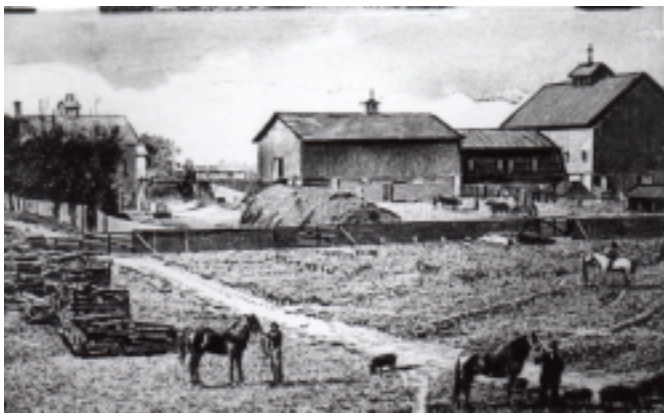
The building on the extreme right, built in 1860, was the first cattle barn. The additions were completed in 1865 as a perpendicular wing. The first horse barn is to the extreme left.

The original Iowa State barn was built in 1860, along with the Farm House, as the first two buildings on the new campus following establishment of the College and Model Farm site.