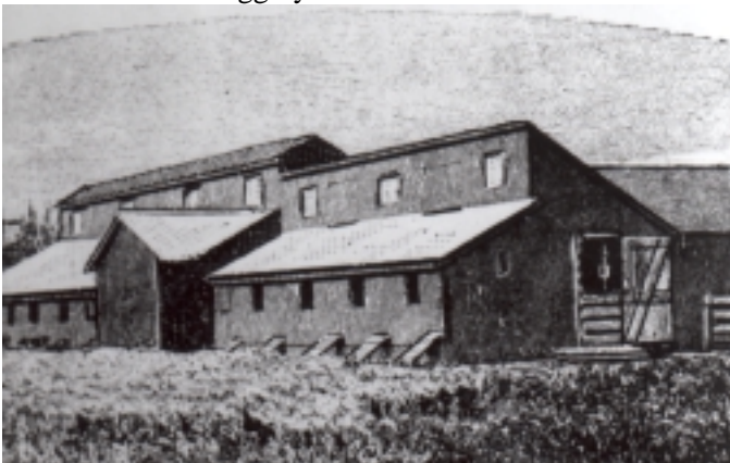
The Piggery was one of the first major buildings on campus dedicated to pork production.

Minutes of meetings and annual reports indicate that discussions relative to need for hog houses and pens were common as early as 1858. Various hog facilities were constructed in 1866, 1867, 1868, and 1880; and 1886 notes indicate that a hen house was remodeled to accommodate hogs. The major hog house constructed in 1886 was called Piggery.