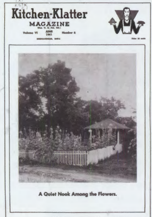
Kitchen Klatter Magazine, June 1941

Schuman, the Iowa Cookbook Collection webpages have grown considerably; and visibility of the collection will be expanded due to Schuman's efforts to develop new and up-to-date webpages, that can be found at: http://www.lib.iastate.edu/spcl/exhibits/iowacookbook/home.html .