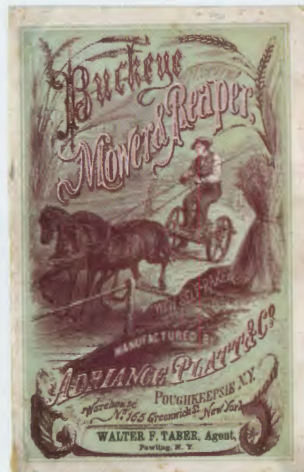
Buckeye Mower and Reaper catalog cover, 1874

In addition to information on a particular implement, the product literature can be used for a variety of research purposes such as advertising, agricultural iconography, and attitudes towards farming. The product catalogs often contain descriptions of the company and its implements, how they can be used, and sometimes brief histories of the machinery. The cover art of each company's product catalogs changes