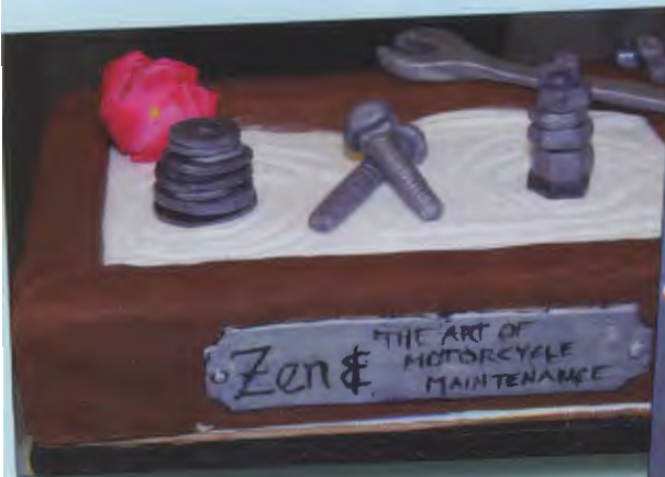
Clockwise, from top of right page: Green Eggs & Ham , Girls on the Roof , Tale of Two "Satays" , Kitchen Garden , Students checking out entries , Lord of the Wings , Zen & the Art of Motorcycle Maintenance .