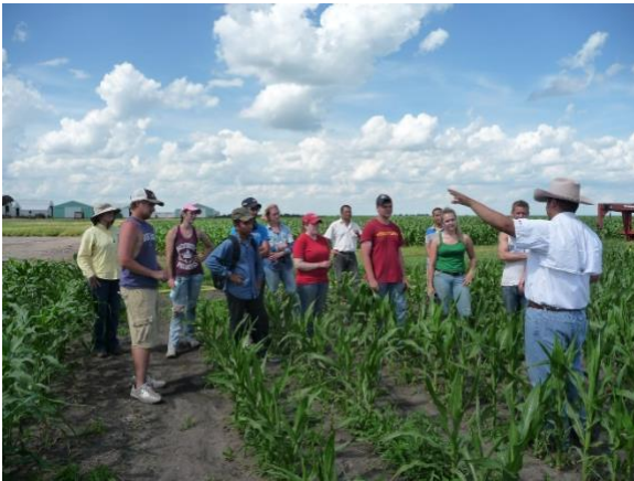
Figure 3. A graduate student leads a group of students through the haploid nursery.