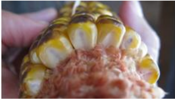
Figure 2. Haploid selection based on a seed color marker. Induced seed have a colored crown, diploid hybrid seed has a dark embryo, and haploid seed has a clear embryo (fourth from the left).