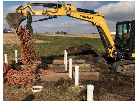
Figure 1. Pilot-scale bioreactors were amended with corncobs in 2018.

Six of the nine pilot-scale woodchip (WC) bioreactors installed at the Agricultural Engineering/Agronomy (AEA) Research Farm were amended with corncobs (CC) in 2018 (Figure 1). After modification, three bioreactors contained 25% CC + 75% WC, three bioreactors contained 75% CC + 25% WC, and three unamended bioreactors contained 100% WC. The flow conditions were adjusted to achieve treatment times of 2-, 8-, and 16-hours. Water samples were collected at each bioreactor inlet and outlet, and were analyzed for nitrate concentrations to calculate the percentages of nitrate removed.