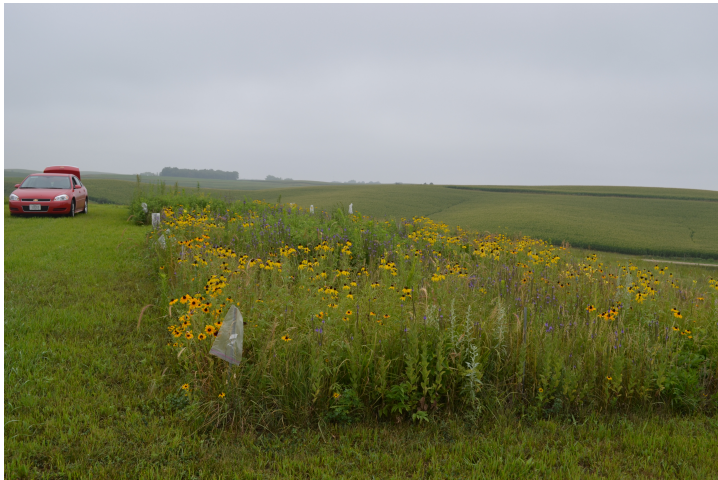
Figure 1. Vegetation in experimental biochar plots, June 2013.