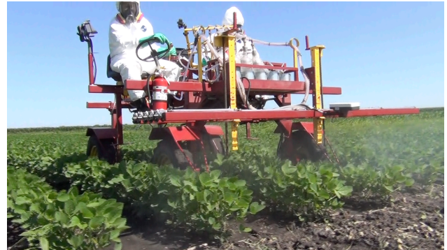
Figure 2. Self-propelled research sprayer applying treatments in Ames, IA.