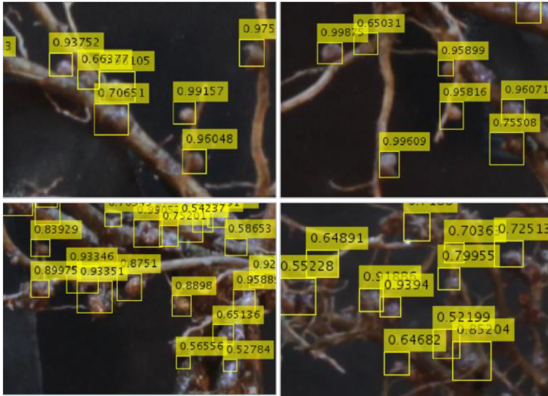
Figure 1. Nodules classified by SNAP.

In this figure, bounding boxes and their respective class scores show the confidence of the box containing a nodule on soybean roots.