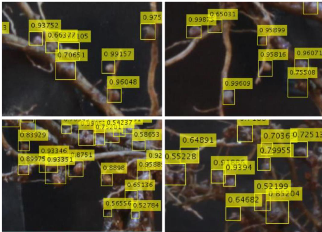
Figure 1. Nodules classified by SNAP.

In this figure, bounding boxes and their respective class scores show the confidence of the box containing a nodule on soybean roots.