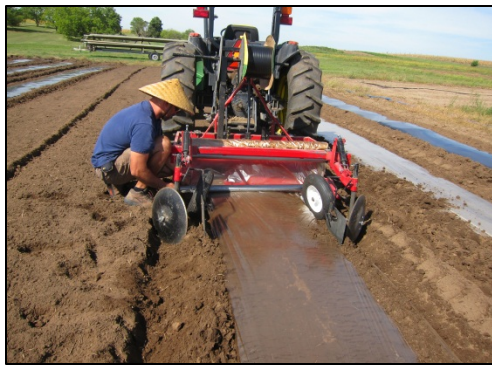
Figure 3. Laying of Greenshift plastic mulch using plastic mulch layer.