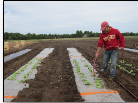
Figure 2. Watering of lettuce transplanted on September 13, 2012.