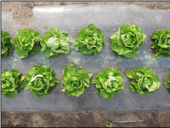
Figure 7. Lettuce in Greenshift plastic mulch treatment at the time of harvest.