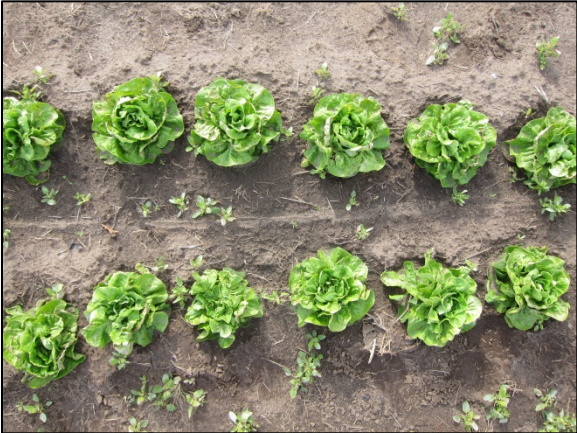
Figure 5. Lettuce in bare ground treatment at the time of harvest.