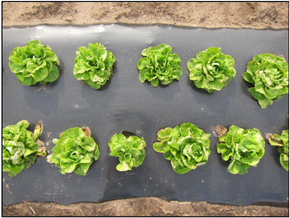
Figure 6. Lettuce in black plastic treatment at the time of harvest.