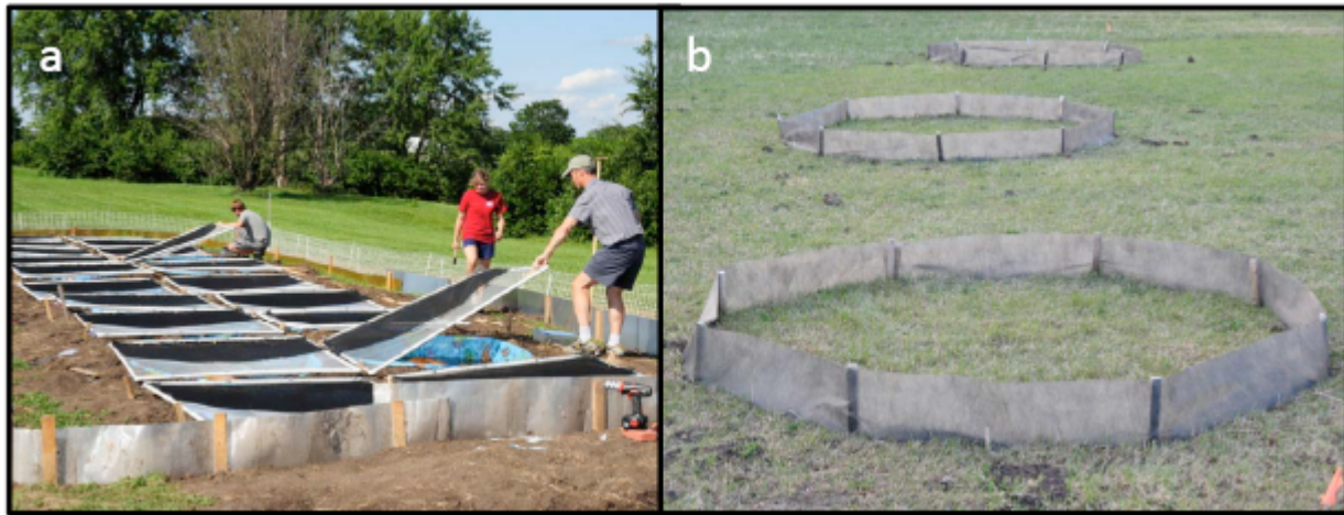
Figure 1. (a) An array of 20 pools where turtles were raised until hibernation; (b) Three of 20 circular arenas used to measure locomotor and orientation performance after hibernation during terrestrial dispersal of hatchling turtles.