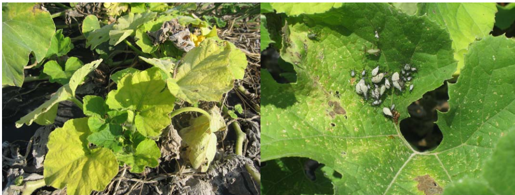
Figure 3. Cucurbit yellow vine disease (symptoms left) was newly discovered in Iowa and is vectored by squash bugs (right).