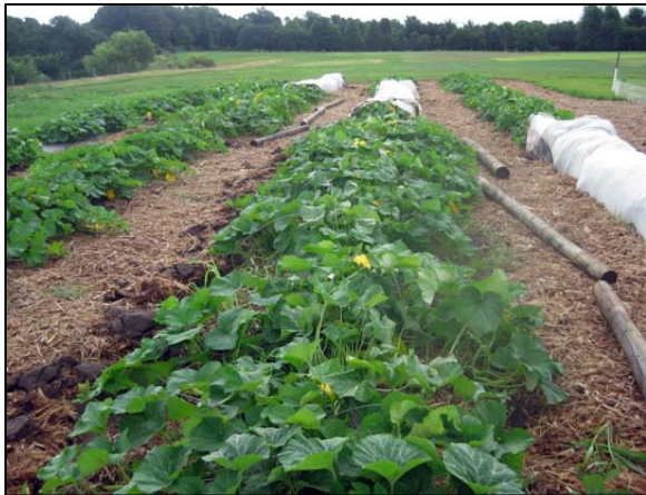
Figure 1. Row-cover treatments during anthesis.