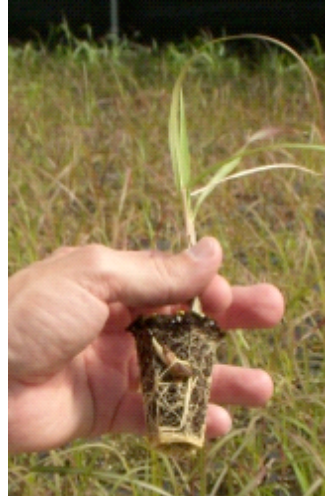
Figure 1. Greenhouse grown plug of M. x giganteus .