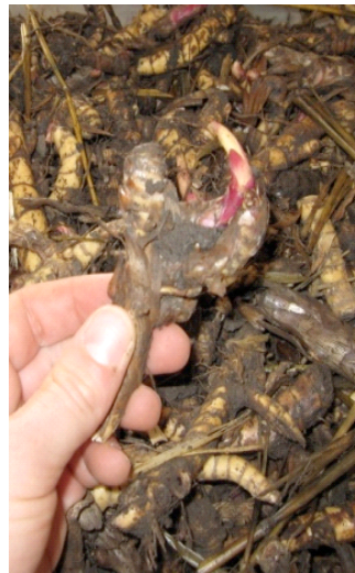
Figure 2. Field dug rhizomes of M. x giganteus .