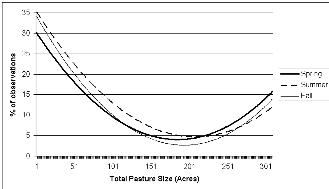
Figure 3. Proportion of all cattle observations in streamside zone in 2007, 2008, and 2009 as affected by the total pasture size.