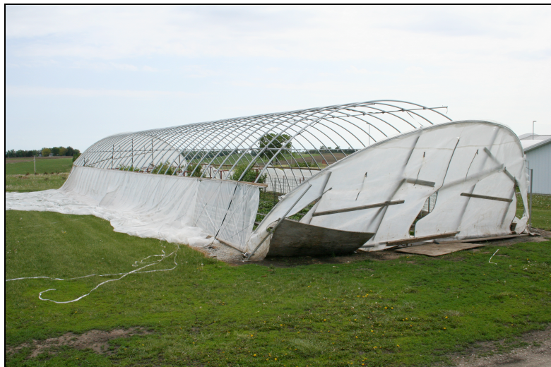
Figure 3. Wind damage to the high tunnel at the Armstrong Research Farm on May 25, 2008.