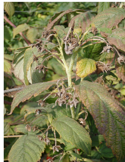
Figure 4. Botrytis fruit rot on Autumn Bliss raspberry blossoms and developing fruit.