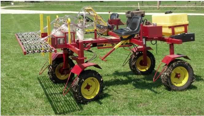
Figure 2. Self-propelled research sprayer built by Iowa State personnel.