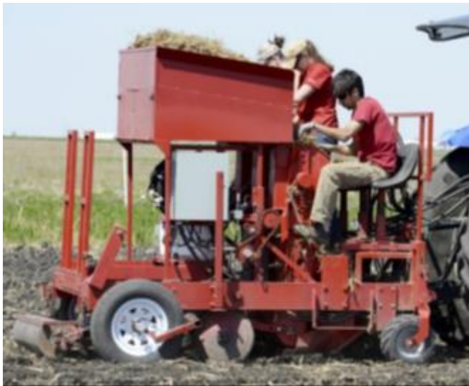
Figure 2. Proprietary M. × giganteus rhizome planter.