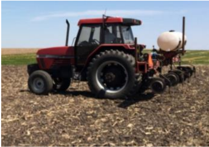
Figure 1. Side-dresser used for applying liquid UAN to M. × giganteus plots prior to planting.

and in-kind contributions are provided by Iowa NSF EPSCoR, ISU Department of Agronomy, University of Iowa Office of Sustainability, REPREVE RENEWABLES, LLC, and New Holland Agriculture. The authors also would like to acknowledge and thank the farm staff at all LAMPS locations.