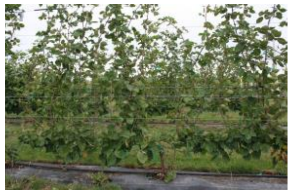
Figure 2. Photographs of rotating cross-arm trellis systems used in thornless blackberry research plots at the Armstrong Memorial Research and Demonstration Farm, Lewis, IA, 2013.