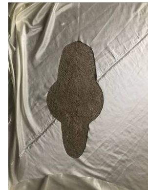
Figure 2 Cut out of crotch curve and waist

Both the pants and all bodice pieces are cut on the bias which gives a flattering look to the garment when placed on the body. Because of the radial nature of the circle pattern the pants can be cut on the bias without requiring any additional fabric. Additionally, the bias fits more snugly to the body than a straight grain bodice. The circle allows for a lot of added fullness in the pants which when draped gives the illusion of a skirt instead of pants. This gives a visual impact of elegance for the bride on her wedding day to have a full jumpsuit that is just as glamorous as if she were wearing a very full wedding dress. Cohesion comes into play in the flower motifs on the garment. There are fabric flowers along the hemline of the garment as well as embroidered flowers on the straps. The flowers are at the top and bottom of the garment which gives balance to the piece.