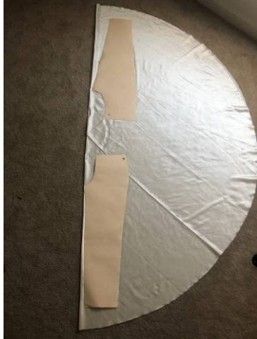
Figure 1 Layout of Radial Pattern

jumpsuit. I found a pattern that had a diamond gusset sewn in the inseam of the pants and the pants used up all the parts of the rectangle. I modified this to create a diamond gusset in a circle pattern. After constructing a sample, I found this did not work for my silhouette. The gusset created lots of draglines at the crotch which caused the stomach to billow. In my second sample, I knew I had to develop a pattern that had traditional crotch seams instead of a diamond gusset. My idea on how to create this pattern without side seams can be seen in Figure 1, my slopers are set on a circle of fabric (the lining) folded in half. Figure 2 is the crotch and waist cut out of the middle of the circle. The curves on the bottom are the front crotch, the curves in the middle are the waist, and the curves on the top are the back crotch. I used the leftover fabric from the lining being cut out of the circle to cut out my outer shell and lining bodice pieces, and the straps.