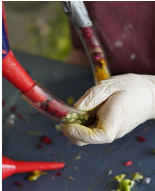
Figure 3. Pouring resin into PVC tubing

Fight or Flight is a visually impactful, unique, and sentimental handbag accessory that is meant to evoke an emotional conversation in regard to mental health. The combination of aesthetic and visual elements make for an interesting and complimentary piece that can elevate and add meaning to any wardrobe.