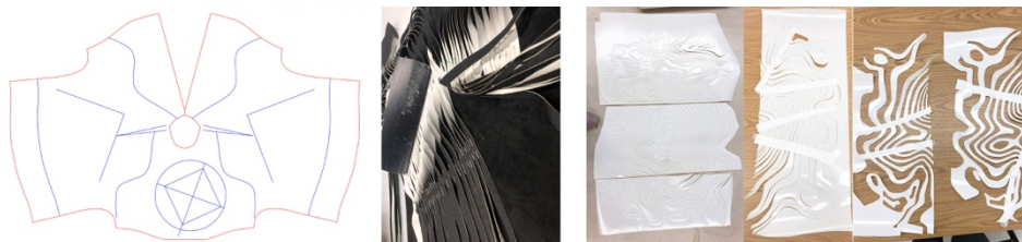
Figure 3. The vector graph for laser cutting and engraving (left); the pinning process(middle); the separating process of two sets of patterns (right)