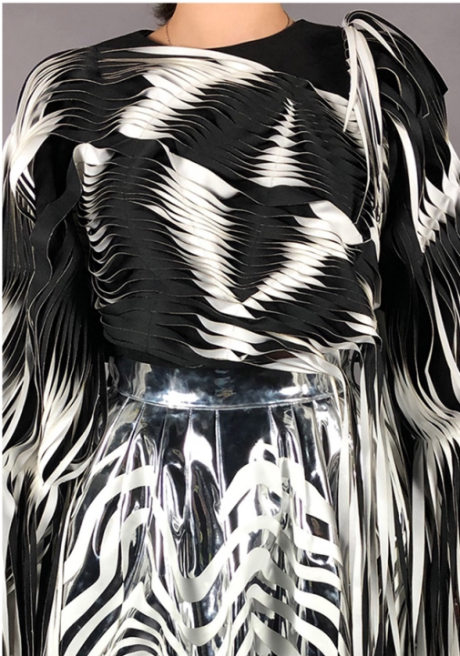
Image D- Detail view