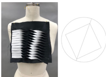
Figure 1. Fabric manipulation swatch and sewing path of vector lines for the top

The first step involved creating motif patterns for laser cutting. Two motifs were created separately for the top and the skirt. The designer experimented with different means for fabric manipulation, and then confirmed that the method displayed in Figure 1 should be the final technique used to create the top. The designer used Adobe Illustrator to make a stripe pattern with different widths as cutting lines and a sewing path (see Figure 1) for creating an optical motif. The actual effect of the graphic pattern was revealed after the garment was stitched. In this step, only the width of the line and the path of the stitching could be designed.