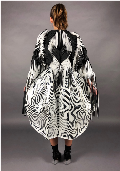
Image C- Back view