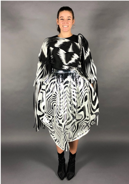
Image A- Front view