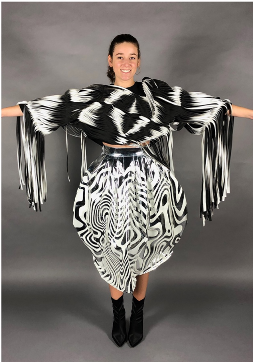
Image B- Front view