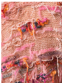
Figure 3. Knitting techniques

Process, Technique, and Execution. This design involves multiple steps: ideation from textile manipulations, materials gathering, sample swatch creation for gauge measurement, knitting procedure development, and knitting. This knitted design was created using a standard size hand-