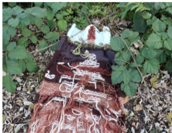
Figure 1. Vertical weaving technique: Roots

Aesthetic Properties and Visual Impact. The design probe starts from creating multiple fabric manipulations inspired by landscape scenery views such as blooming, roots, and blossom.