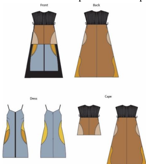
Figure 1. Design sketches.