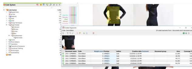
Figure 1. Content Analysis: Coding in MaxQDA

A total of 656 ITAA creative scholarship proceedings from every fourth year (2000, 2004, 2008, 2012, 2016) was independently reviewed and coded by three researchers. A MaxQDA 12, a software program designed for computer assisted qualitative and mixed methods data was used. The main codes and sub-codes were categorized as level or production, target market, apparel item, sustainability, technology, functional clothing, inspiration, materials, and surface design/design techniques. Researchers had frequent debriefings to ensure the definitions of each code and meanings behind each design work and disagreements in coding were negotiated until the inter-coder agreement of 96% was met.