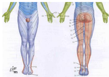
Fig. 1. Dermatomes

To develop cycling shorts, we formed a knee baseline over the 3D human body shape and created inseam from the groin area. Kim(2008) and Choi(2011) studied the deformation characteristics of the body surface according to the cycling posture to obtain non-extension lines. As shown in Fig. 1, the dermatomes L1–L4 were generated in a similar direction along the meshes of the normal body and cycling posture.