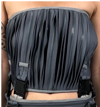
Figure 1. A wavy texture surface of the fabric consisting of zippers

With the worsening of the environment and rise of diseases worldwide, environmental protection has attracted more and more attention from the public and scholars. The importance of sustainable development through sustainable practices is that it protects our ecosystems, preserves our natural resources, and improves our quality of life (Bansard & Schröder, 2021). However, production lines in the apparel industry not only contribute 10 percent of human carbon emissions through mass production, but also cause serious water pollution and water depletion (UNECE,