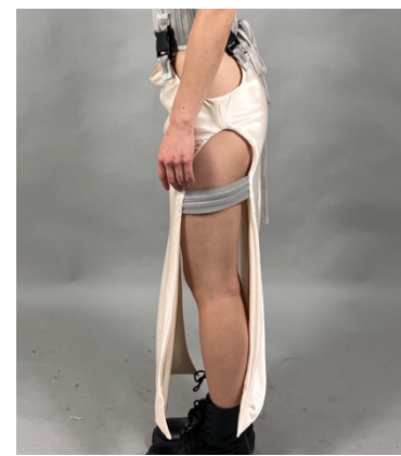
Figure 3. Side view of the underskirt