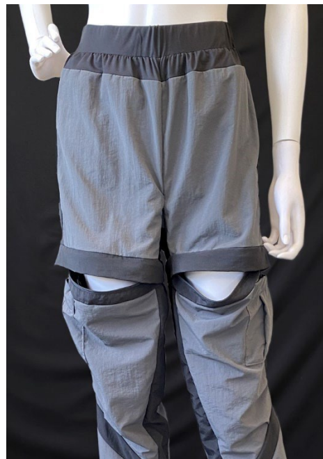
Figure 2. Pant legs partially unzipped

Aesthetic Properties and Visual Impact: The bands in the pants provide graphic interest and movement to the outfit. Additionally, the bands offer many options for inserted pockets like the one on the back left hip of the pant. A piece of reflective fabric is inserted into the back jacket at the center of the yoke seam to aid in wearer visibility. Rather than work with multiple colors, I chose a neutral, monochromatic color scheme to be acceptable to more consumers. The overall silhouette is very typical of hiking attire, and typicality has been shown to be preferable by consumers when considering zero-waste apparel (Michaelson & Chattaraman, 2017). If reduced visual contrast is desired, the bands can be the same color as the rest of the garment.