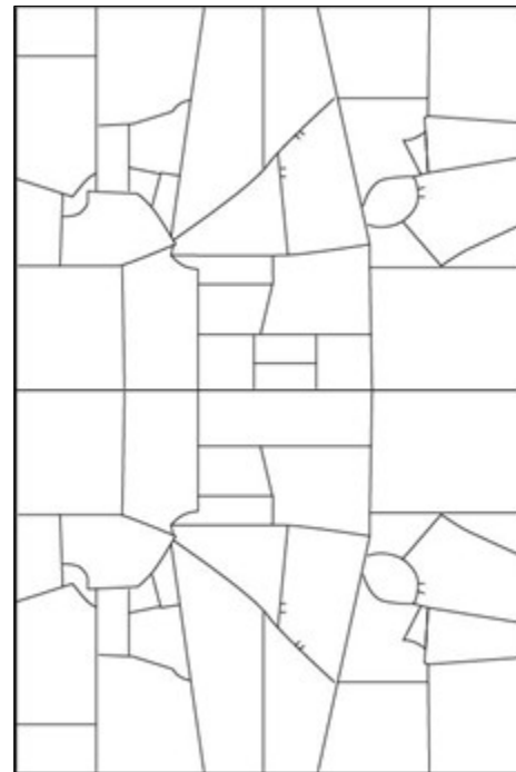
Figure 1. 85'' x 55'' pattern layout

A gray 2-ply nylon woven fabric with wicking capabilities and a durable water-resistant finish was selected for both garments. Such a fabric is commonly used for hiking pants and jackets by outdoor brands. Most of the bands used to grade the pants were cut