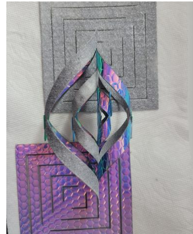
Figure 1. Laser cut trap shape manipulation

Process, Techniques, and Execution: The design silhouette of the inspirational photo was cropped in Adobe Photoshop and laid on top of a female muse model in Illustrator until the construction was proportional. The silhouette was identified as a sleeveless top with an invisible zipper in the center back and a full circle skirt with hook-and-eye closure. The patterns were developed in CLO3D and simulated on a size 4 female avatar to adjust fitting and length. The digitized patterns were printed and cut from the vinyl fabric and then assembled by a home-sewing machine and by hand.