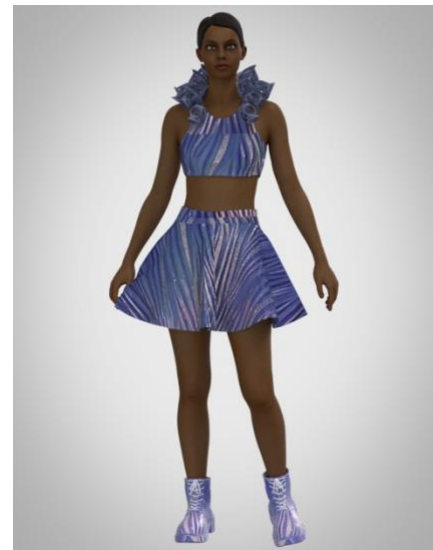
Figure 2. Simulated patterns and “fish traps” on CLO3D avatar