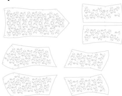
Figure 2-digitized patterns with laser cut design

The ensemble was started by draping the bodice, skirt, and collar pieces. After the drapes were transferred to patterns, I used Adobe Illustrator to digitize the pattern pieces. I used Procreate and Adobe Illustrator to create the laser cut design and added it to the pattern pieces (Figure 2). After the file was complete, I used an Epilog Fusion M2 75-watt laser cutter to apply the design to the fabric as well as cut the pattern pieces. The digital fabric print was painted using Procreate and edited using Adobe Illustrator (Figure 3). The printing service through Spoonflower was used to order 100% cotton fabric with my digital fabric print.