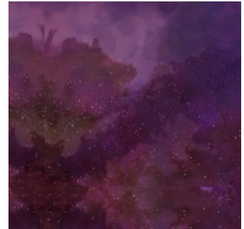
Figure 3-digital painting used for fabric print

This ensemble displays two fabric manipulation techniques, laser cutting and digital printing. The surface design of the laser cut fabric layered on top of the digital fabric print emphasizes the design inspiration of a constellation.