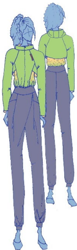
Figure 2: Design ideation

Statement of Purpose: This ensemble focused developing a on high-performance ensemble with the functionality needed for outdoor sports, specifically rock climbing. Rock climbing is a rigorous outdoor sport that is very physically taxing and requires a wide range of motion. The climber wears a harness and is attached to a rope system, so they must wear specific clothing that fits these requirements while not interfering with their gear (Michaelson, Teel, Chattaraman 2018). When outdoor climbing, climbers are very exposed to the elements on the rock face and changes in the weather can affect them greatly. For this project, the designer specifically sought to design functional attire for female-identifying rock climbers. Females were targeted because the women's climbing market is currently growing exponentially, with more female interest in climbing (Michaelson, Teel, Chattaraman 2018). Further, the target market is otherwise active in other outdoor sports with a passion for the outdoors. She enjoys climbing, fishing, backpacking, camping, and more. She wants high performance clothing to match her lifestyle. This look is specifically designed for female climbers aged between 25-35 who live in outdoor-adjacent states, have bachelors or master's degree in fields like engineering or software development, and have a 6-figure salary with disposable income. Their favorite outdoor brands are Arcteryx, Mammut, and Norrona.