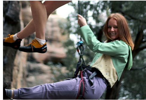
Figure 3: Ensemble being wear tested.

Most notably, the jacket features a new kind of garment waterproofing system that allowed a partial waterproof system to target area of the body that need water protection, while also providing mobility and breathability (Figure 1). The placement of the waterproof areas is a novel combination of textiles allowing air flow in higher sweat regions with waterproof rain protection in the hood, sleeves, and yoke to protect the wearer from weather. The membrane uses a patented lamination process to allow for partial membrane placement in strategic regions (U.S. Patent No. US10750805B2, 2020).