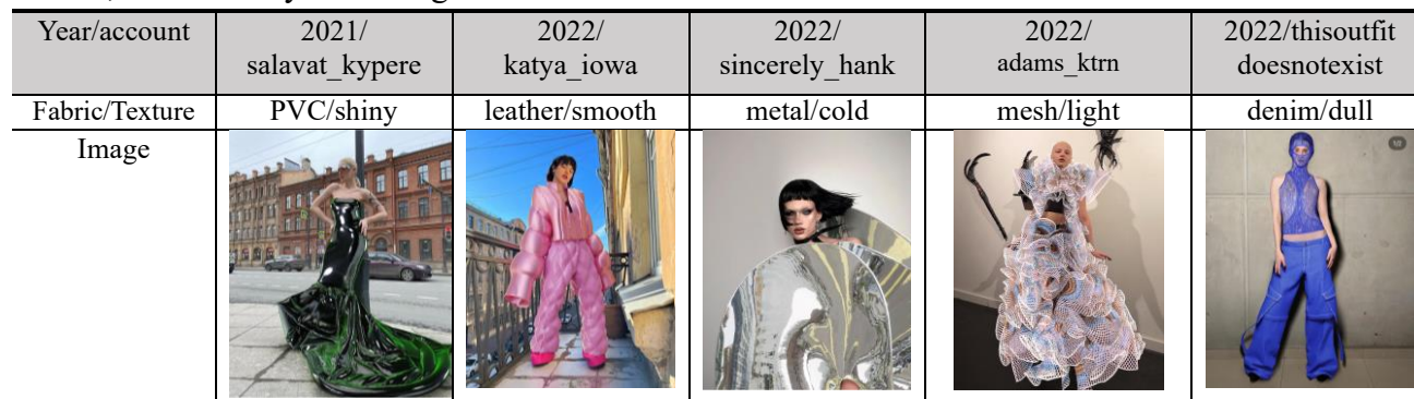
Figure 1. Samples of Digital Fashion on IG

hashtag, and link. We derived six pairs of adjectives describing texture after removing terms with similar meanings and inadequate for virtual texture in Koester (1993): W1: Rough-W2: Smooth, W3: Limp-W4: Crisp, W5: Shiny-W6: Dull, W7: Clingy-W8: Rigid, W9: Cold-W10: Warm, W11: Heavy-W12: Light.