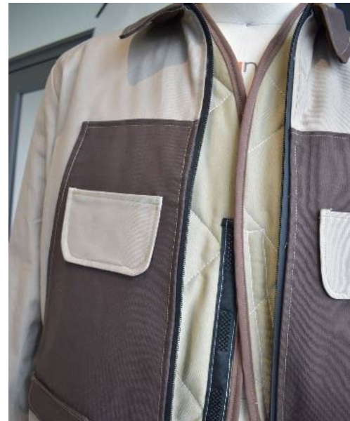
Interior insulation vest using Morito Snap Tape closure.

Process and Execution: Although the garment may not look extremely technical and/or advanced, all the processes used in the construction of the garment were modernized. For the initial design, I created the garment in CLO3D and I checked the fit virtually on an Alvanon Men's ASTM Regular Size 38. Once the garment had a good fit in CLO3D, I exported the patterns to Adobe Illustrator and prepared the cut files for laser cutting. After the fabric was laser cut, construction started. All the components were assembled using industrial sewing techniques. I developed three samples of the jacket to perfect the fit and pocket placements. I fit each sample on an Alvanon ASTM Men's Size 38 dress form. After each fitting, I modified the virtual patterns in CLO3D and re-exported the file for laser cutting. This resulted in also having the 3D virtual model updated during the