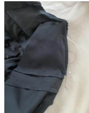
Figure 2. Seam allowances of inside and outside vest layers stitched together to close stuffed sections

Due to the inclusion of in-seam pockets along the side front hem area, the front waist-to-hem sections of the vest had to first be individually stuffed before being sewn to other pieces. This allowed space for in-seam pocket bags to sit between the puffed layers. An additional zero-waste pattern for interlining of the front waist-to-hem sections was created to act as a backing when stitching and stuffing the bottom half of the vest (Figure 1). All other sections of the vest were stitched shell-to-shell and fiber filling was inserted to create the puffed effect. Once the front lower sections were pre-stuffed, two full vests were constructed (inside and outside layers) leaving one seam of the center back band open. The two vests were then stitched together along the dashed lines of the pattern, stuffing each section in the process, and moving from side seam to center front/center back. Each quilted section was closed at the seamlines by stitching the seam allowances of the two vests together (Figure 2). At center back, the garment was closed using the stitch-in-the-ditch method and the armscye and hemline were finished with bias binding.