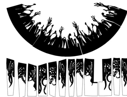
Figure 2. Engineered prints on digital flat patterns