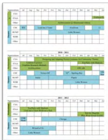
Figure 1: Project Timeline

Prior to my tenure review, I had not been able to easily document the process of these accomplishments. In order to illustrate my work in the world of fashion and costume I created a collection charts, steps, and timelines to help clarify the design specific competitions, projects, and publications. The methodology used in setting up this collection of information is general to specific.