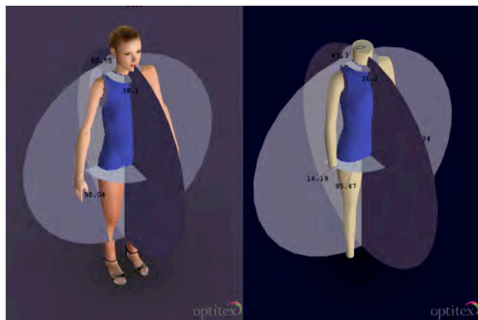
Figure 1. Sagittal, Frontal, and Transverse Planes

In order to create a parametric avatar of an average size 6 older woman, standard body measurements from ASTM D5586/D5586M-10 for women aged 55 and older were used. Based on the ASTM standard data we manually morphed the default Optitex Eva parametric avatar to represent our target population. To evaluate the differences between a realistic body and a standard dress form, we used a parametric size 6 Optitex dress form. Upper body patterns were drafted directly on both of the 3D parametric models by using the Optitex Flattening module in PDS 12. For placing the same body landmarks on the two models, sagittal, frontal, and transverse planes were placed to divide the body into left and right, front and back, and upper and lower. A slanted transverse plane was also placed on the neck circumference to aid the design process (Figure 1). Following the drafting,