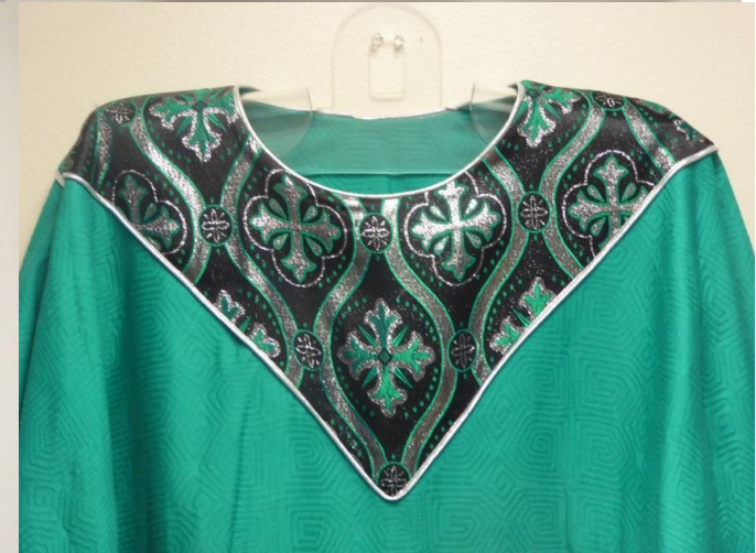
Front, back and detail for Priest's Chalice Title: Tradition and Simplicity Inspired a Set of Catholic Liturgical