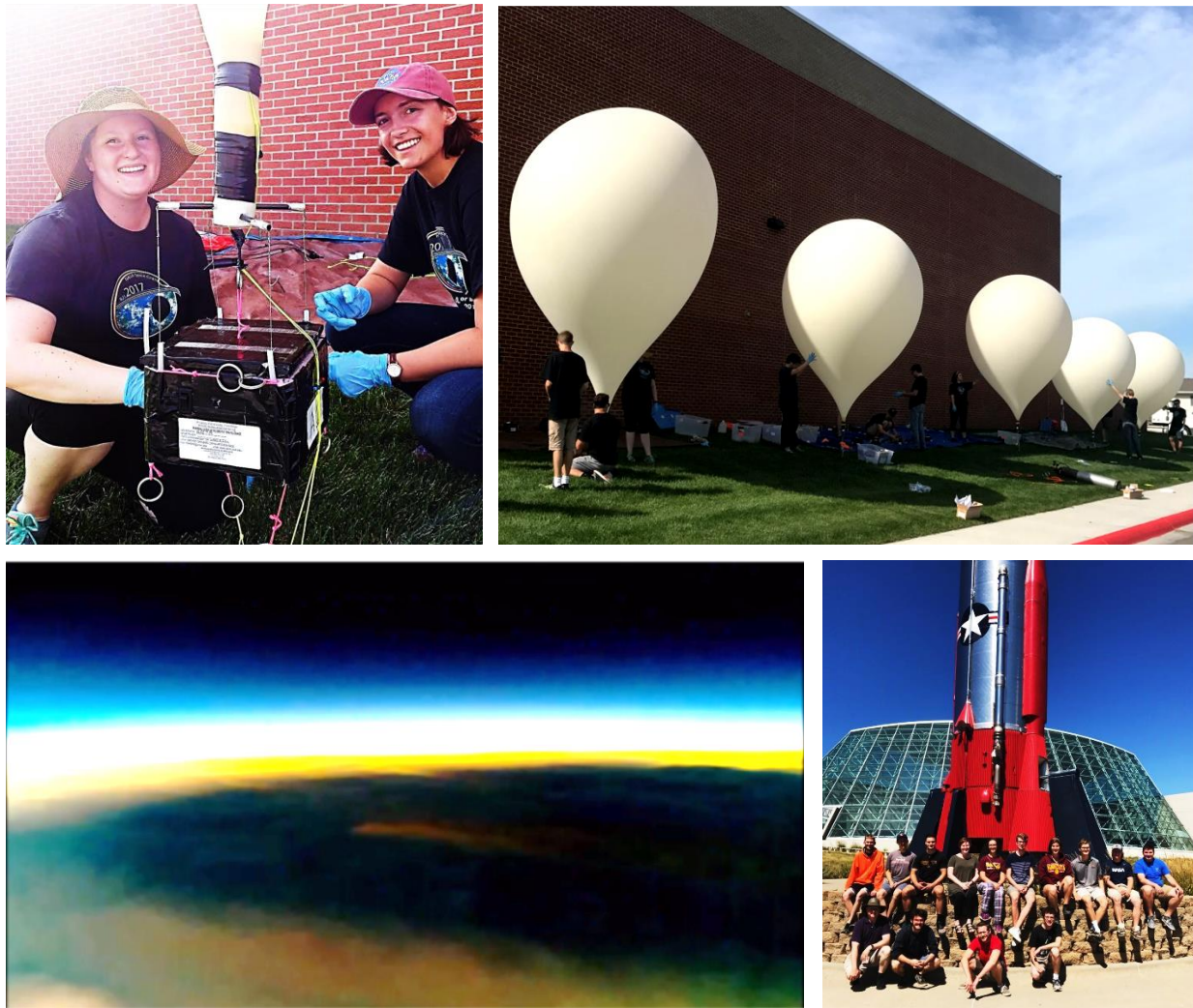
Fig. 4 Images from eclipse trip (left to right then top to bottom): (a) passive anti-rotation device, (b) line of balloons, ready to release, (c) view of receding eclipse shadow from 66,000 feet above Grand Island, Nebraska, and (d) UMTC team (most of it) at Strategic Air Command (SAC) museum on return trip to MN.

The balloon inflations, tethers, then timed launches went very smoothly, especially considering the fact that our team had never tried a five-balloon launch and about half the people at the launch site were not actually on the summer 2017 ballooning team (though most did have past experience with ballooning). One balloon – the very last one to be launched – looked distorted even during inflation and ultimately popped early at 49,000 feet, about 15 minutes before totality. Prior to burst that balloon had a good video feed to the ground station in Grand Island.